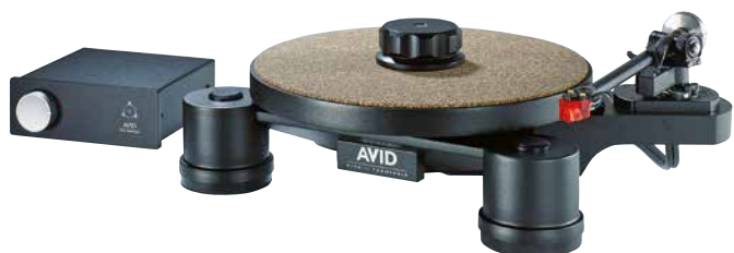
◀ The normal Diva II, with which the „SP“ only shares its basic aluminum chassis.

By this point you may get the feeling that this “super-Diva” is going to be demanding to use, but far from it: the delicate-looking but robust turntable turns out to be a sophisticated but fuss-free vinyl player (at least after the above-mentioned finger exercises).