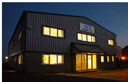
▲ The inconspicuous company headquarters of Avid – bursting at the seam. A move is impending.