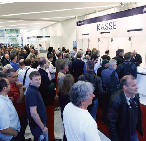
▲ A familiar picture: the HiFi fans in line at the register.

On May 5, the HighEnd trade fair opens its doors, and the organizers promise the show has never been bigger, more interesting, or diverse. STEREO knows just why it's worth a visit