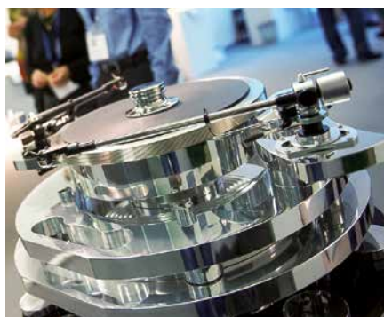
▲ Record players are in again. Especially the jewels by Transrotor will draw looks and awaken desires.