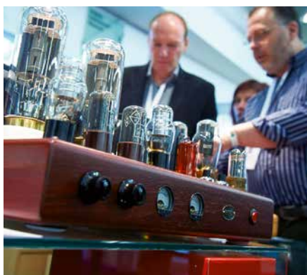
▲ There is a lot to discover in Munich – e.g. exotic tube amps which you can see very rarely.