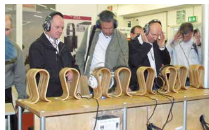
▲ Caption? You'll find a wide selection of headphones at the counter. Try and compare all kinds of models to your heart's desire

In the general opinion, the HighEnd has long since become the most important event of its kind in the world, surpassing all international competitors. Nowhere else in the world can people interested in refined technology and high quality music reproduction look at – and listen to – as many products, or get as much information.