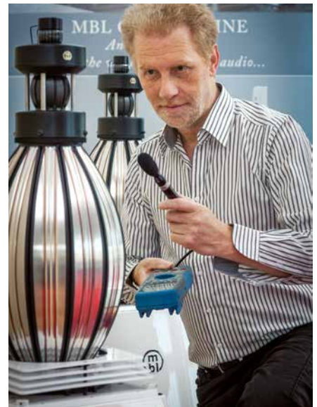
▲ The frequency response of the unique radial emitters has to drop slightly in the high treble

But how do you get there? Rice summarizes his experience like this: „When you're in college, you believe in measurements: if something had less distortion then it just had to sound better – and if