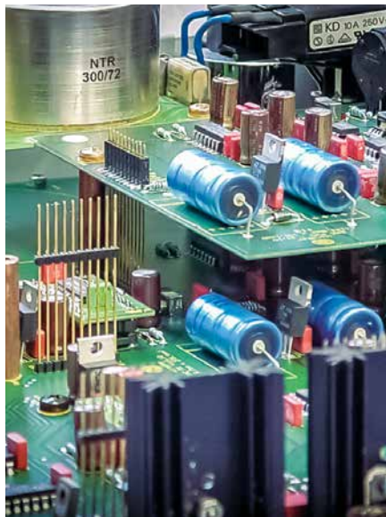
▲ The sound is defined by the components, selected through measurement and listening alike