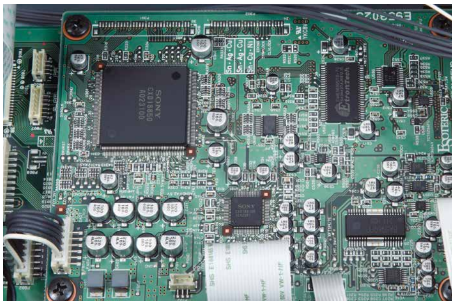
▲ Whenever you see SACD, you know that Sony is there: drive control and signal analysis – like all functional groups – are arranged on their own circuit board.

upsampler (called "D/D converter" in Esoteric jargon), every aspect can be switched on and off, which makes the K-07X an inexhaustible playground for high-enders who like to experiment.