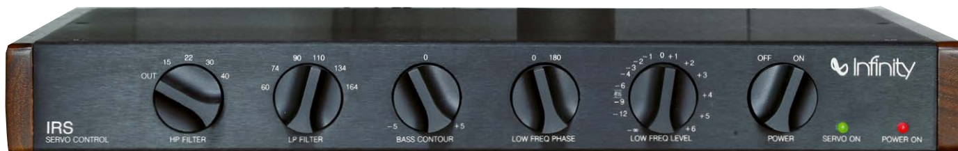
▲ The active crossover allows the optimal adjustment of the woofer towers to room acoustics and „satellites“.

at least the male part of the population still got together often to listen to music, while the vast majority of their female counterparts retreated into an internal emigration and attributed, disapprovingly but powerlessly, the passion of men and their buddies to mental confusion and a lack of aesthetic style.