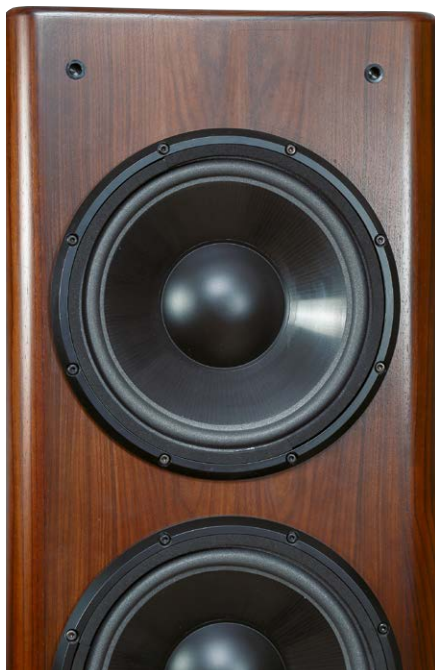
◀ A woofer with a new foam bead and stiffer dust cap than in the original.