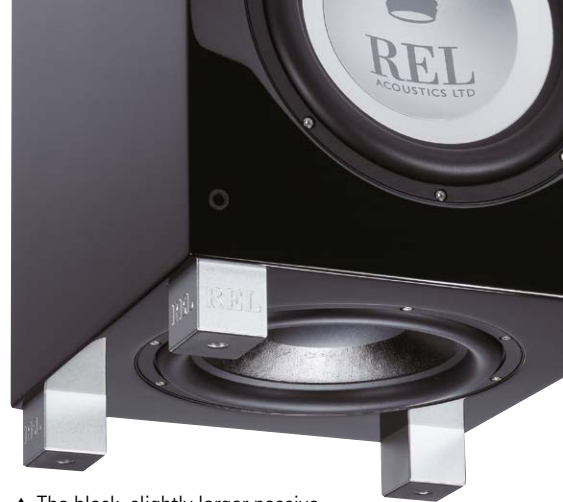
▲ The black, slightly larger passive woofer fires downward to create bass reinforcement and tuning

For an additional 230 Euro, a wireless connection solution named “Arrow” is available: claiming practically no additional delay, its signal transmitter and