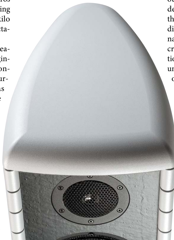
◀ The multifaceted, extremely rigid and low-resonance cabinet of the DARC 100 is also pleasing from above.

As virtually no oscillation-energy migrates into the cabinet, the speaker has a particularly precise take on natural dynamics. Already at low volumes, even the finest level differences are audible, and previously barely perceptible details are rendered exceptionally clear-cut. Should there be something like cabinet-related distortions, they were apparently eliminated entirely. These hardly measurable crossover- or chassis-associated distortions make you want to turn up the volume, as the speaker never softens the bass or annoys in the midrange and treble. More examples of the exquisite ingredients contributing to the speaker's qualities are the 20-millimeter tweeter driver with diamond-diaphragm, costing an extra 4000 euros per unit, compared to the ceramic version, and the custom-built ceramic drivers. A specially damped 17mm chassis is responsible for the midrange. Thanks to the neodymium magnet