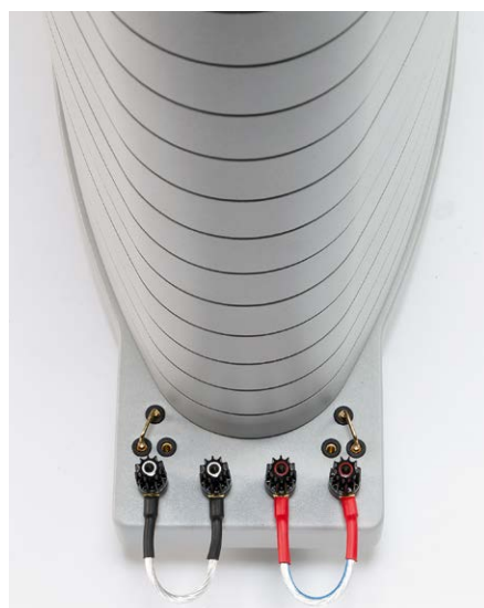
▲ The slim base features the WBT Next-Gen-connectors and adaptation bridges for bass and treble.

even more so with closed eyes. They appear to only spread the energy of the sound events they radiate. When the just mentioned bells are ringing, they can be clearly assigned to their tonal origin, while still distributing their energy over the heads of the listener and throughout the room. The Gauder succeeds in combining perceivability with power in the middle range and detailing, each on a qualitative level that is spectacular and outstanding even in the respective individual disciplines. A fusion of these qualities into one was a new and extremely enjoyable experience. The impressions with the Australian rock seniors led to the first listening day having been largely spent cavorting in the area of classic rock – from Deep Purple to Led Zeppelin and Queen. At first, we did not even get the idea of seriously looking for classic audiophile qualities, because many of the songs that had been familiar for decades could be seen (heard) under a completely new light and some entirely new aspects were uncovered in them. Bass guitar riffs, whose existence could previously only be followed fragmentary, now showed constant presence, and technical subtleties of the strumming were reproduced without any effort at all.