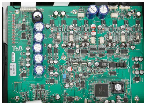
A look below the "bonnet" reveals a picture book circuit design with top components and short signal paths.

Tonally, the sum of improvements is still noticeable, while, thanks to its universality, even the price is ultimately blurred – great work! ■