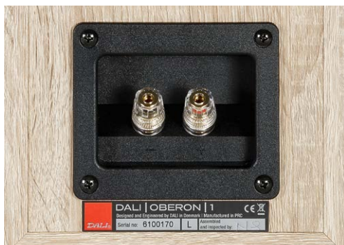
A single-wire terminal is not only to be expected, but also reasonable in this price class.

Soundwise, the smallest Oberon is an agile and crispy fresh, even somewhat cheeky and characterful speaker, whose joy of playing infects the listener. It brings the necessary energy and is a lot of fun, reminding us of the enormous class of her bigger siblings, while also having that touch of gentleness that makes even bad recordings bearable. A great bargain! ■