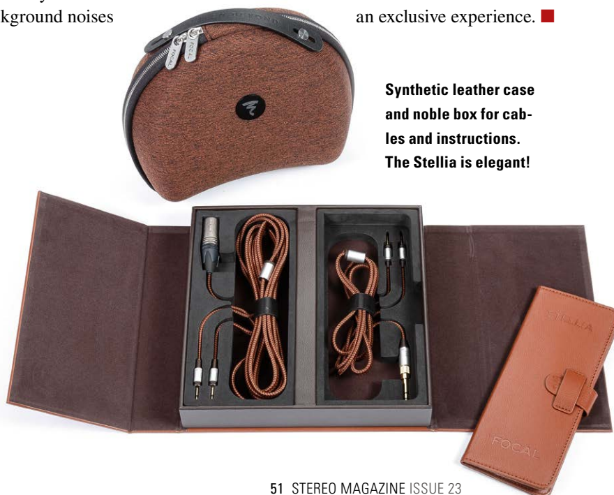
Synthetic leather case and noble box for cables and instructions. The Stellia is elegant!

– something Focal should revisit in the future. On the other hand there's absolutely nothing to complain about with the usually most difficult discipline for closed headphones: bass reproduction. Lightning fast and clean, with realistic mediation of swinging fur, a drum in „The Fokie“ by the Chieftains is depicted – great. Even complex sounds of all kinds do not seem to be any obstacle, are, instead, presented in a clean and detailed manner and make time with the Stellia an exclusive experience. ■