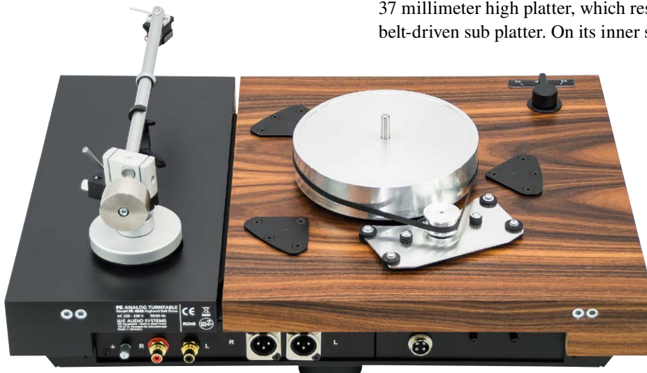
The sub-platter is driven by a flat belt and sits, like the tonearm, on a spring-loaded inner chassis. The motor is connected to the frame. The MKII version of the PE4040 offers both Cinch and XLR outputs for balanced operation.

Now the first record was placed onto the felt mat of the 3.5 kilogram and impressive 37 millimeter high platter, which rests on a belt-driven sub platter. On its inner side it