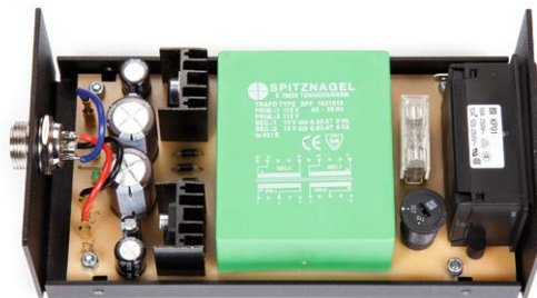
The external power supply is located in a metal enclosure and avoids interference fields inside the turntable. Its cable is one meter long.

One cannot say that the Swabians were being stingy in this regard, as with the „top“ of Ortofon’s „MC Quintet“ series – the Black S – they did not make any compromises. The stylus is equipped with a hard, stiff sapphire needle carrier, the tip of which carries a diamond with an elaborate „Shibata“ cut and moves little coils of gold-plated, high-purity