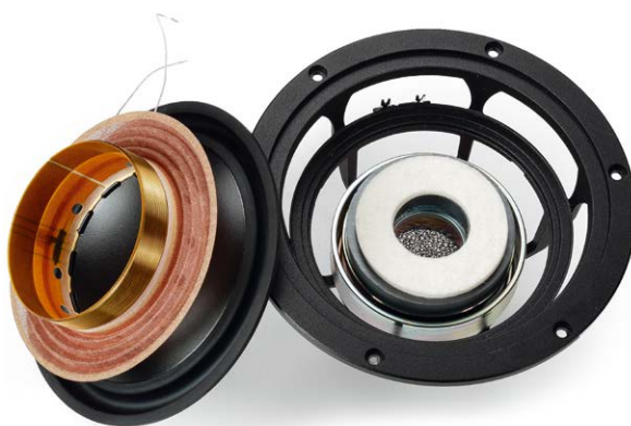
◀ In addition to its large voice coil, the 17cm woofer has a coarse-meshed – and therefore breathable – centering spider.

This is also the case with the Esotar Forty tweeter, which as the name suggests is a development of the company's famous Esotar2. However, for use in the anniversary speaker, it also received the more powerful „neodymium engine“ and an