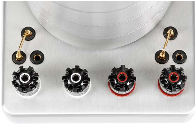
Noble WBT sockets and terminals for bass and treble adjustment.