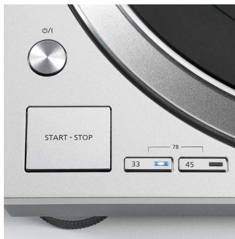
Below the main switch (above) is the large „Start-Stop“-button, next to it the buttons for the speeds of 33, 45 or even 78 rpm.

A second slider activates an automatic device that lifts the pickup, for example at the end of Ravel's „Bolero“, out of the outlet groove after a few seconds, which is intended