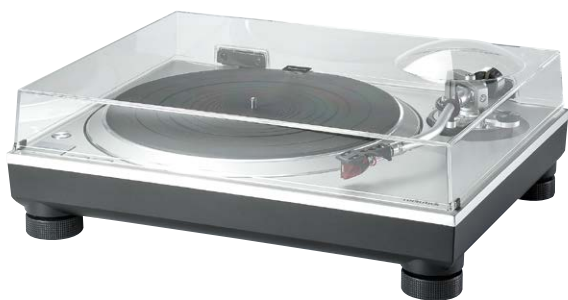
The SL-1500C comes with a flat dust cover with a characteristic curvature, creating room for the tone arm base.

In this form, the complex titles of Deacon Blues' concert in the Glasgow Barrowlands, where, amongst other challenges, the front stage had to be set apart from the audience staggering in depth, were no problem. Once again the SL-1500C proved its finesse and qualified as a tip for pleasure listeners, who don't care about anything else – and for whom it leaves no excuses. ■