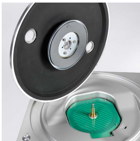
When the plate is lifted, the magnetic disc of the drive can be seen. The plate has a damping rubber layer on its underside.

The SL-1500C is quickly assembled. It is child's play to place the platter underneath of which the magnetic disc of the drive is