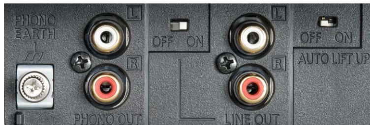
If you want to use the phono input on the amplifier, use „Phono Out“ (l.). If the internal phono pre is activated, the cable belongs to „Line Out“ (r.). „Auto Lift“ lifts the scanner out of the groove at the end.

located. Also the MM pickup – the tried and tested 2M Red with elliptical diamond from the Danish specialist Ortofon, which costs 110 Euros by itself – is pre-assembled in the headshell and only needs to be attached to the arm with a union nut. Adjusting the tracking force is also a breeze.